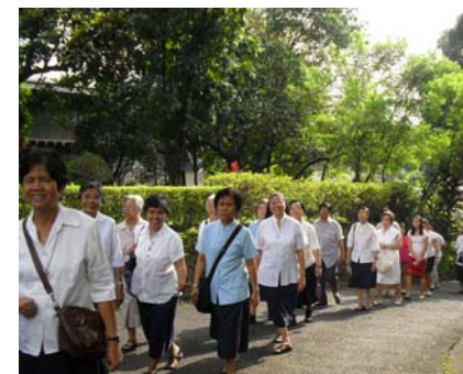
Procession in Quezon City