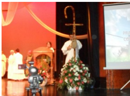
The Shepherd's staff

Good Shepherd Sisters, representing the different communities in the Philippines, Sisters from other countries who are here for studies, and Filipinas in foreign mission came for the celebration.