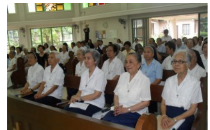
June 21, 2011. Golden Jubilee of Philippine Novitiate.

will be distributed to communities and friends. Please encourage your friends to reserve copies. Cost per copy in the Philippines is P2,000.