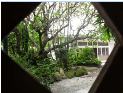
Entrance Garden of Museum Idyll

December 7, 2011- 40th Anniversary of Reach Out Davao