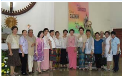
Lay Affiliates of the Good Shepherd