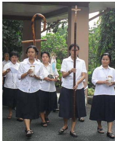
September 8. SBC Batangas hands over the Shepherd's staff to NCR.