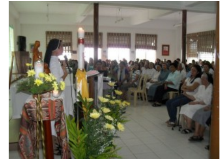
May 11, 2011. Golden Jubilee of Contemplatives in the Philippines.