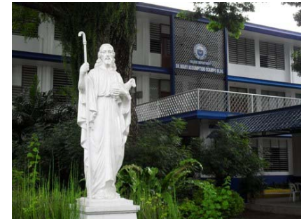
Good Shepherd Statue, Batangas

31—SBC—Batangas; September 8—NCR; November 21—Cebu 2012- January 16—Baguio; March 25—Cavite; May 2—Bicol; July 31—Mindanao; and September 29—Isabela.